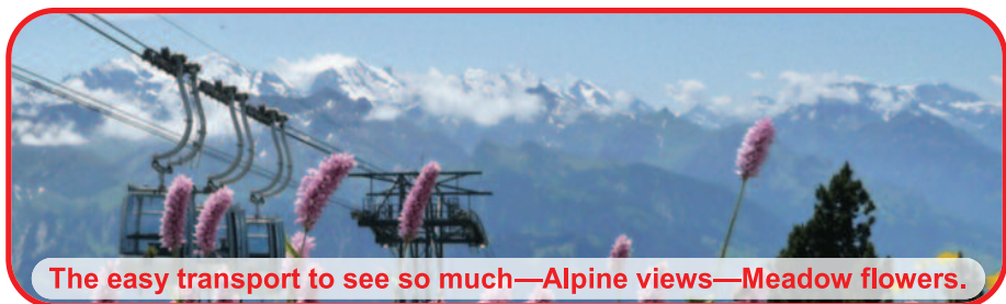
The easy transport to see so much—Alpine views—Meadow flowers.