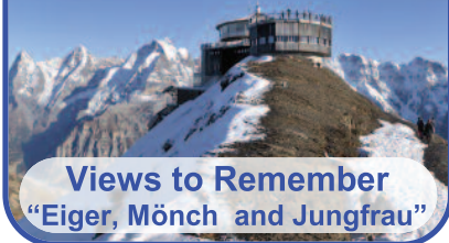
Views to Remember "Eiger, Mönch and Jungfrau"